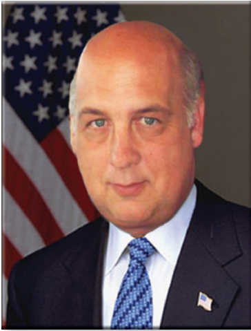
Scott Rasmussen Founder, media commentator, author, publisher

If you want to be in touch with people of influence — in business, government, health, academia — you need to go where they go to tap into the opinion pulse of Americans: Rasmussen Reports